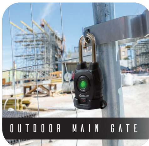
OUTDOOR MAIN GATE