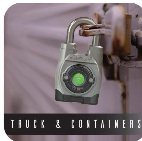
TRUCK & CONTAINERS