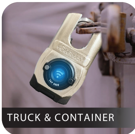
TRUCK & CONTAINER