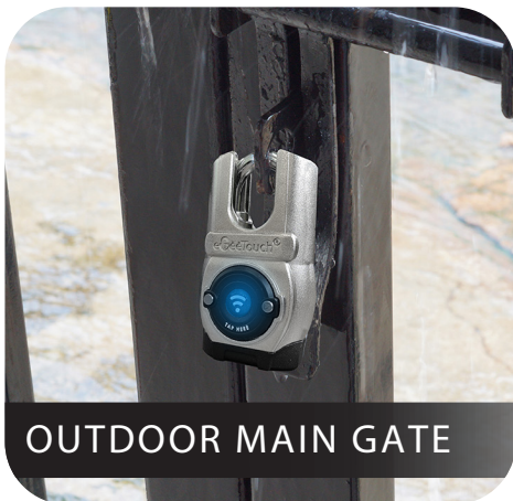
OUTDOOR MAIN GATE