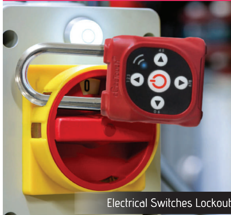
Electrical Switches Lockout

CREATE & ASSIGN Multiple Roles & Levels of Authorizations in ONE Smart eGeeTouch LOTO Padlock