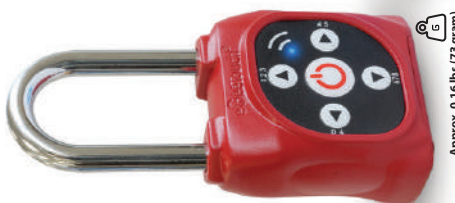
Approx. 0.16 lbs (73 gram)