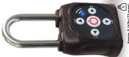
Approx. 0.16 lbs (73 gram)