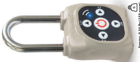
Approx. 0.34 lbs (155 gram)